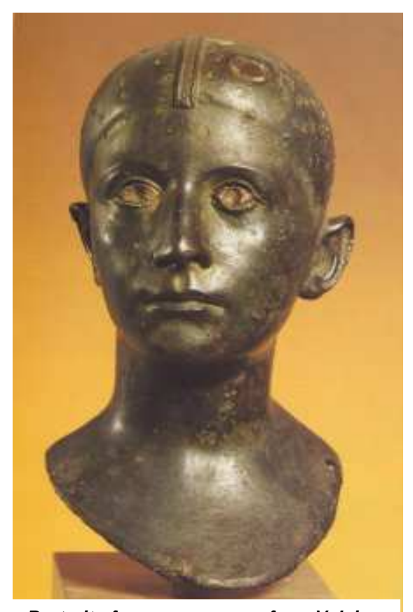
Portrait of a young woman from Veleia

The portrait was found in Veleia on April 28, 1760, near the stairs of the western entrance of the basilica, a short distance from where a limestone inscribed stele was found.