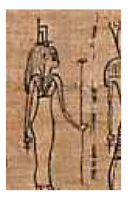
Funerary cult of Isis with Osiris, stele of Pijai XVIII Dynasty Small bronze statues of Isis breastfeeding Horus and of Isis the Queen Winged Isis with her Throne Headdress, the stele of Tausirdjnesnakht, before the domination of Persia Scarab seal that depicts Isis breastfeeding Horus (n. 10.50) Papyrus of Harimuthes, Caretaker of the Golden House of the Temple of Isis, Ptolemaic Era